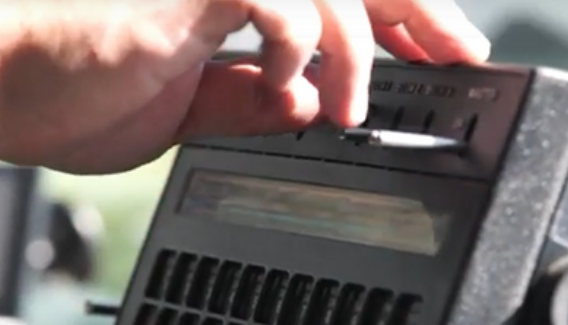
Computer-Controlled Spray Rates