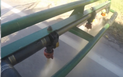
Fold-out Spray Wings