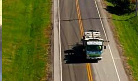
Will Not Cover Pavement Markings